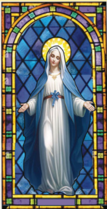
Our Lady of the Immaculate Conception

Last week we mentioned that our new church will display 43 stained glass windows. Below is a sample of one of the windows which we hope to commission our artist to create. This particular window would be one of sixteen clerestory (upper) windows representing various Marion images. It measures 4'-8" x 3'-0" and will reside in the Nave of the church 22' above the floor. You will see other stained glass window designs in future bulletins. Stained glass is one feature of the new church which is not included in our construction budget, but parishioners and even visitors have inquired about how they can sponsor a window. We plan to make these details available to everyone within the next couple of weeks.